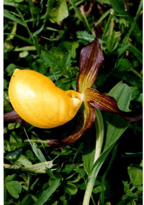
Flat-petaled Yellow Lady's Slipper Cypripedium calceolus , var. planipetalum

If you should encounter this plant, please report its location to Bud Ewacha of CNPS at bud_ge@escape.ca.